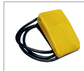
Electric foot peddal