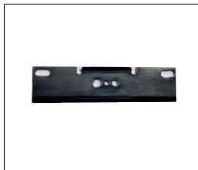
Fixed blade with different beak sizes