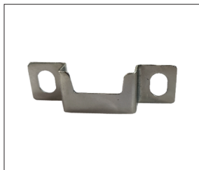
Extra cutting blade